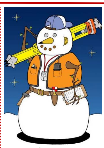
Baby It's Cold Outside!!

Best Wishes. Your Communications Committee